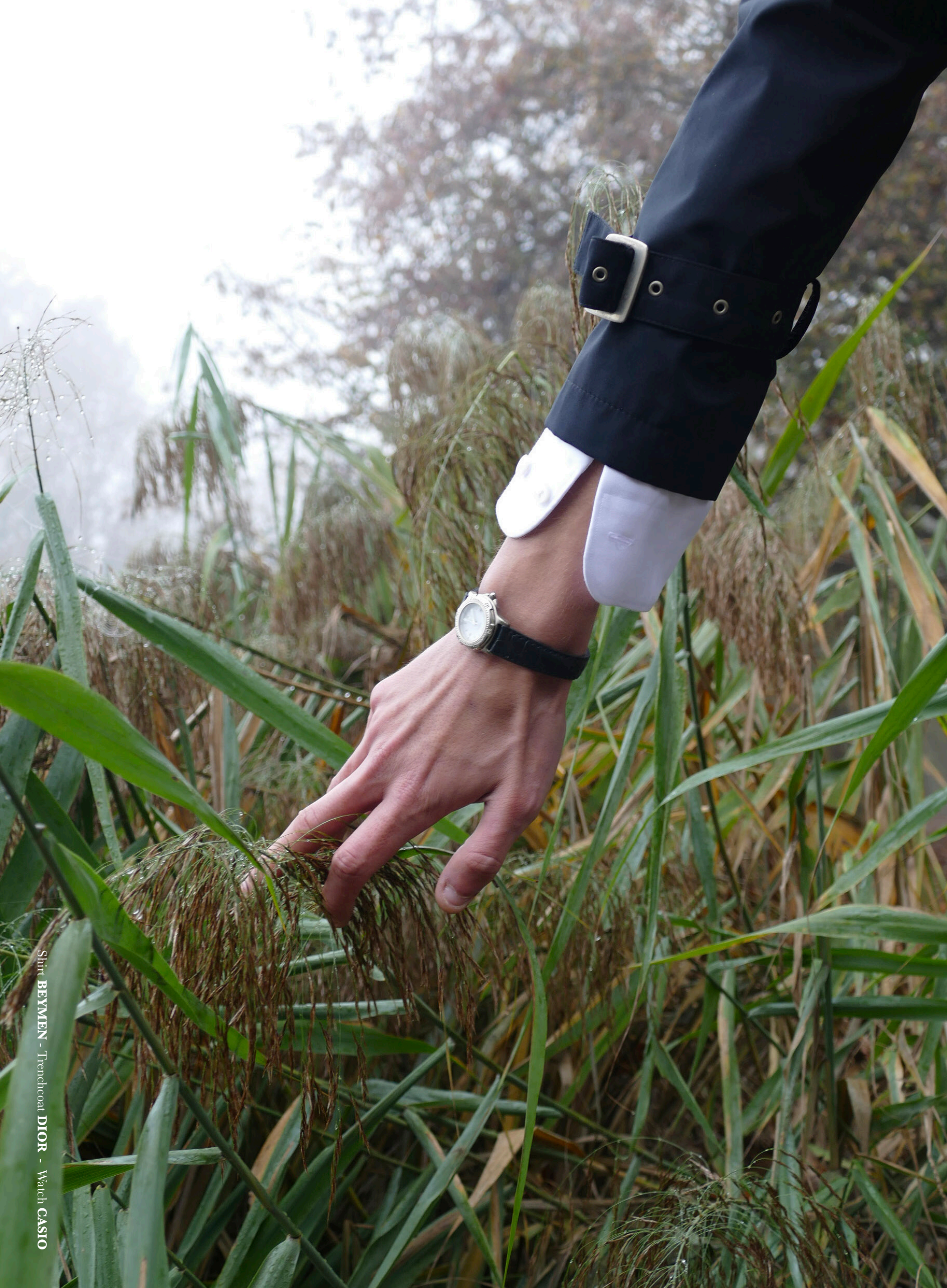
Shirt BEYMEN - Trenchcoat DIOR - Watch CASIO